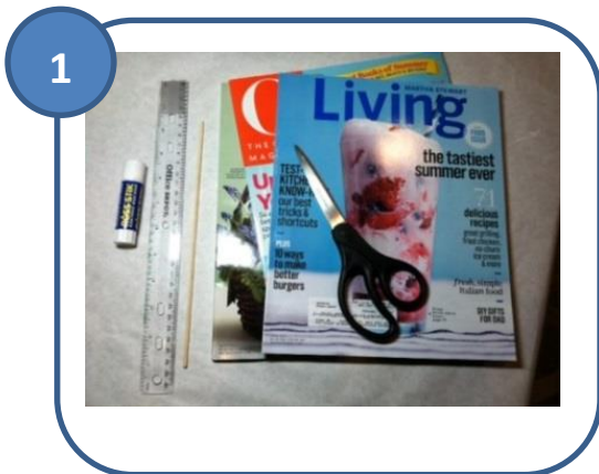
Gather your supplies